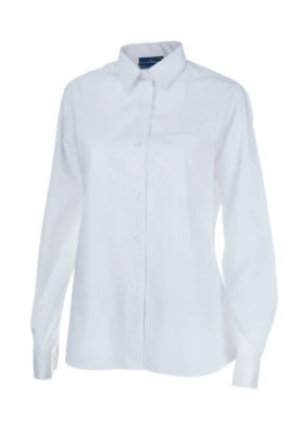
Long Sleeve Blouse White