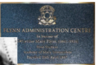
FLYNN ADMINISTRATION CENTRE