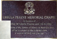
URSULA FRAYNE MEMORIAL CHAPEL