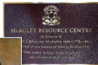
McAULEY RESOURCE CENTRE

Mother Catherine McAuley rsm 1778-1841. Foundress of the Sisters of Mercy, Dublin 1831. "Our centre is God from whom all our actions should spring"